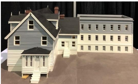
The Shannon Munn Memorial for Boys