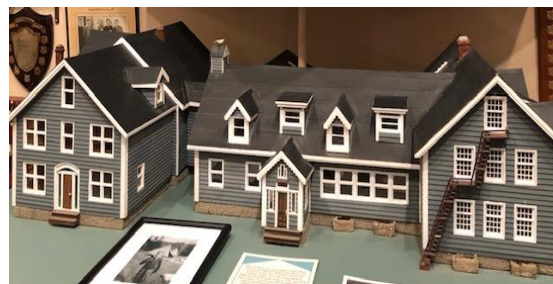
The T.R. Job Memorial for Girls