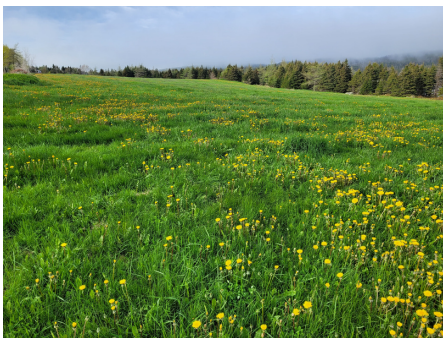
Diocesan Land, Goulds